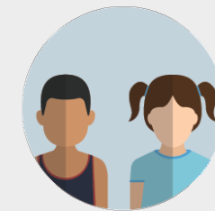
Children and youth