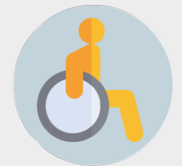
People with reduced mobility