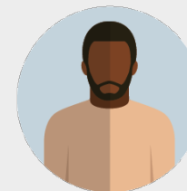
Migrants and ethnic minorities