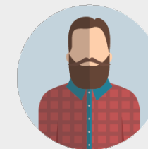
People living in rural and deprived areas